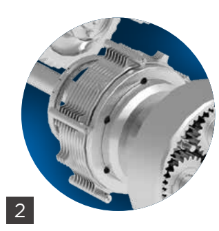
PATENTED SELF-COOLED TURBO BRAKE