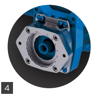
DIRECT MOTOR ATTACHMENT WITH GEAR DRIVE